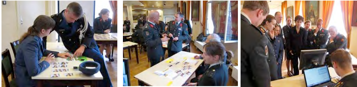
Figure 1: Trial session

With the resulting GCAM2.0 model, several comprehensive field tests have been performed to assess 1) the realism of the model, 2) whether the game adds to an awareness of the comprehensive approach and 3) whether deeper learning about the relation between interventions and effects can be achieved in a more experienced population. In this paper we will report about the outcomes of those field tests.