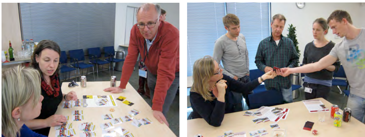
Figure 3: Left strategic planning, right negotiating